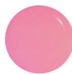
Rose TLT 14%