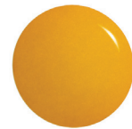
Driver TLT 11%