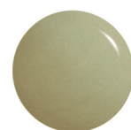
Golf TLT 18%