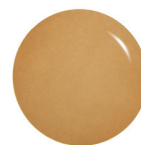
Absolute Brown TLT 9%