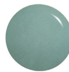
Smoke TLT 11%