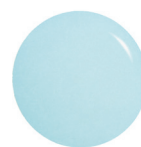
Blue TLT 28%