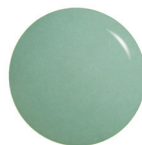
Green TLT 19%