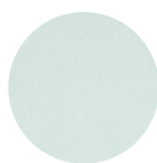
VISION EASE Base Lens TLT* 37%